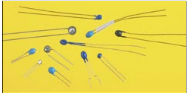
Standard Disc Style